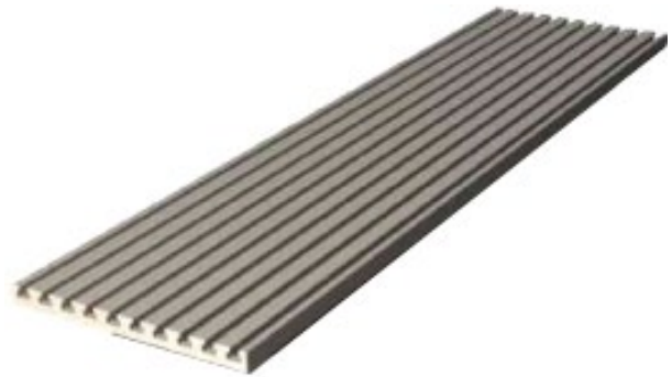
Fig.1 : PT Series T-Slot Base Plate